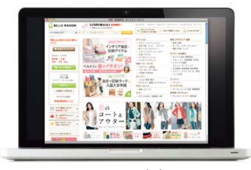
Internet website (Personal Computers)